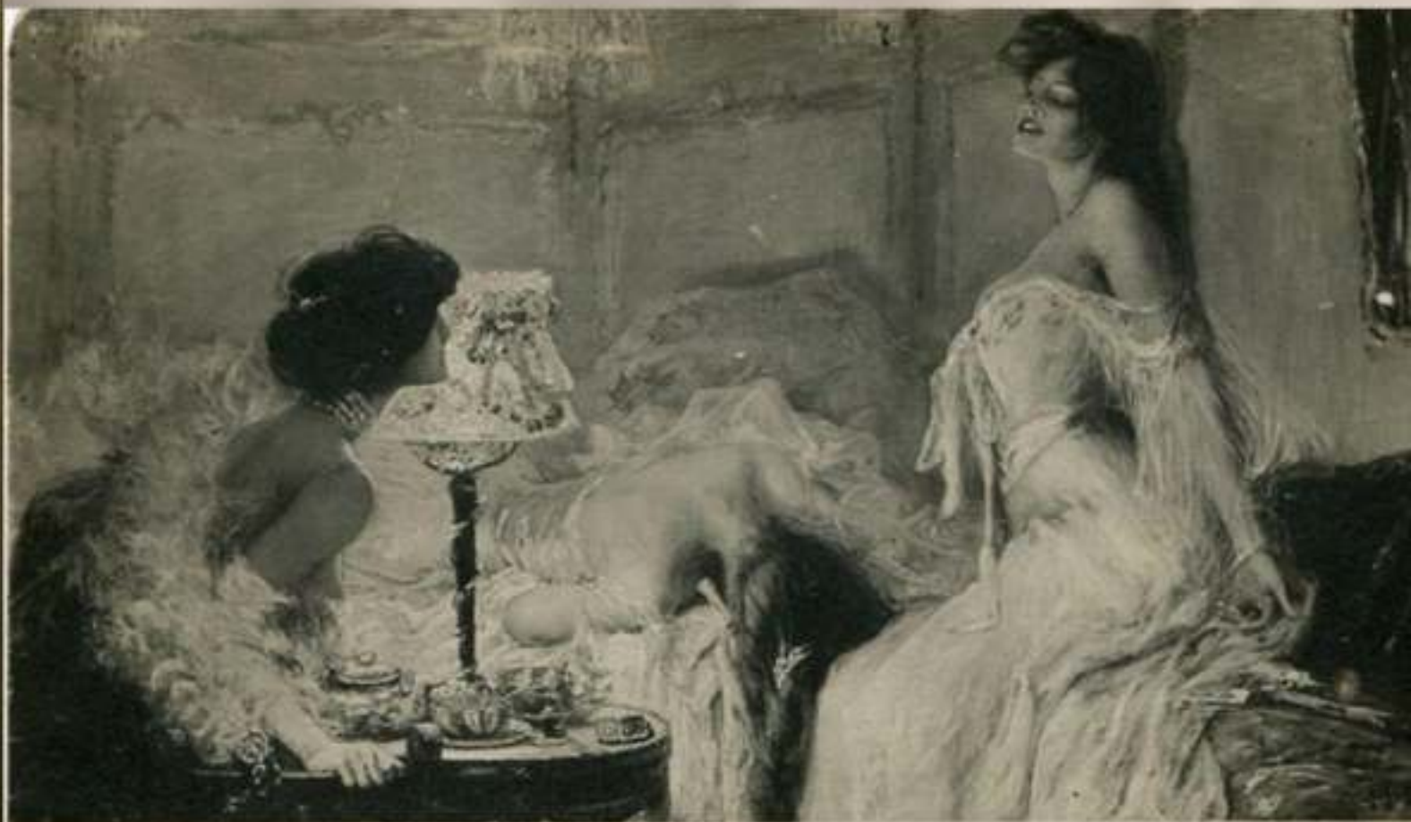
865. Париж. Салонъ. — Морфинистки. — Матиньонъ.

BIBLIOTECA DI SCIENZE MODERNE. F. LI BOCCA ED. N.º 95