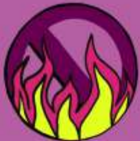
Anti- prohibitionist Commitment