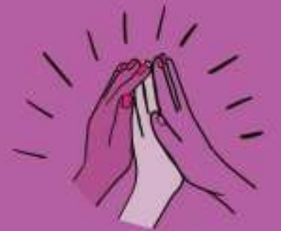
Complicity and Mutual Support